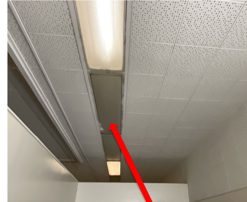
Replace expired lamps