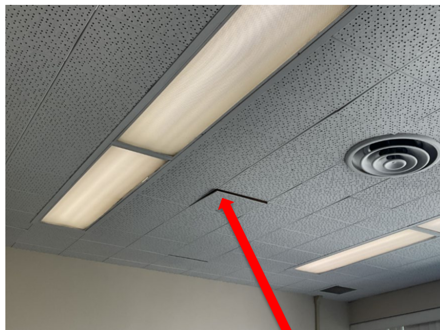
Loose/Missing Ceiling Tile

Address all patching and painting of holes and plaster, secure ceiling tiles that have partially fallen and/or become unstable, replace missing ceiling tile and replace lamps where expired, repair/replace missing/damaged floor tile , and repair any missing or damaged components of rooms throughout the entire King Hall building, all Wings.