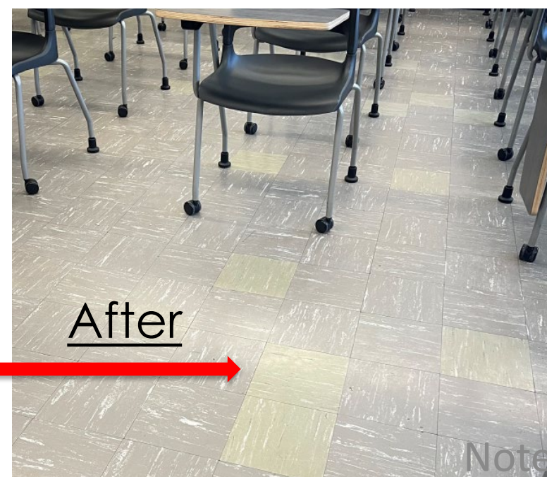
5/13/2024 Replace missing/damage floor tile w/new*