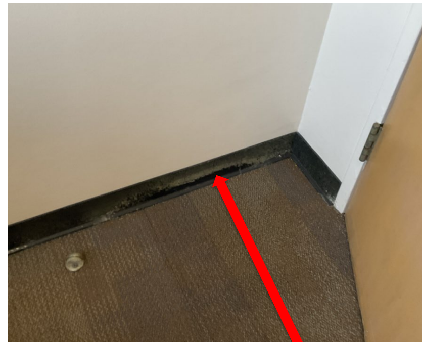
Missing/Damage Cove Base