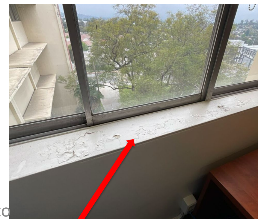
Repair Plaster, Patch Holds/Damage and Paint

Note: The project may change due to unforeseen factors, including vendor availability.