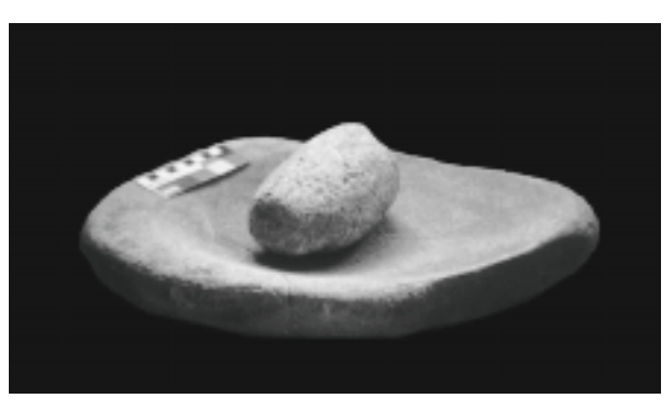
FIGURE 3 A metate with the mano set in the bowl was found buried at the entrance to the cave.

A narrow entrance passage, approximately 5 m long, stretches from the mouth of the cave to a small circular chamber, 2 m in diameter. A number of passages and alcoves radiate off of this chamber. At ground level at the northern end of the chamber is the entrance to a small alcove 74 cm high by 80 cm wide and 230 cm long. The alcove runs parallel to the entrance passage and stone walls appear to have once closed the alcove off from both the entrance passage and the circular chamber. Both of these walls have been pushed over and the soil within the alcove is very disturbed. The soil on the surface contains numerous fragments of human bone suggesting that this space had once served as a tomb. The recovery of a jade bead indicates that the burial may have been richly furnished. All of the ceramic recovered appears to date to the Late Preclassic.