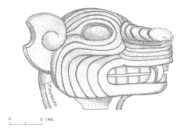
FIGURE 4 Elaborate jaguar head lid handle from Naj Tunich Structure 1.

Like the Naj Tunich structures, the Balam Na burials had also been looted in antiquity as well as in modern times so the lack of rich burial offerings may reflect nothing more than thorough looting. The quantity of jade, pyrite and stone beads at Balam Na Cave 4 is sufficient to make it clear that they do not represent the pattern often noted with the burial of commoners, that is the placement of single beads in the mouths of the deceased. Rather, the small quantity recovered appears to reflect our very limited sampling of the midden associated with relatively rich grave offerings. The occupants of the tombs, therefore, appear to have held elite status. This is certainly consistent with the tradition as it was elaborated during the Classic Period at Naj Tunich. The burial in Structure 1, dating to the Early Classic, contained jade beads and the remnants of several basal flanged bowls with elaborate, modeled lid handles (Figure 4). The rim of a ceramic vessel bearing a hieroglyphic inscription dealing with high political office was recovered from Structure 2, a Late Classic tomb (Figure 5). Thus there is little doubt