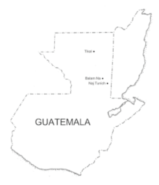
FIGURE 1 Map of Guatemala showing the location of Balam Na and the major cave in the area, Naj Tunich.